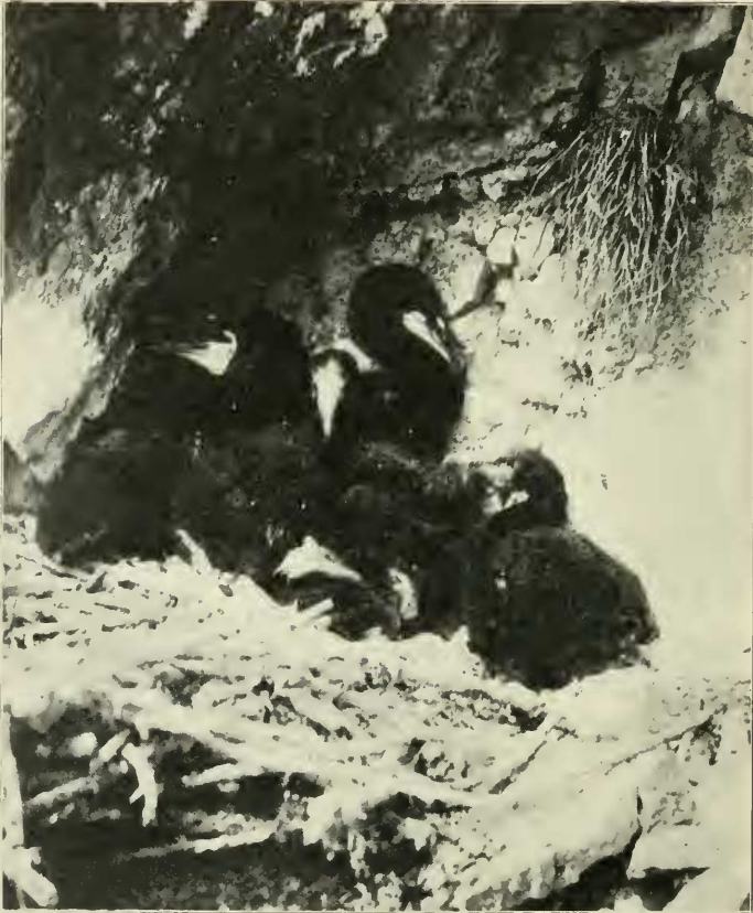
A nest-full of young White-crested Cormorants. Carroll Islet, Washington.

well as the relative position of the eggs was changed each day, even if only slightly.